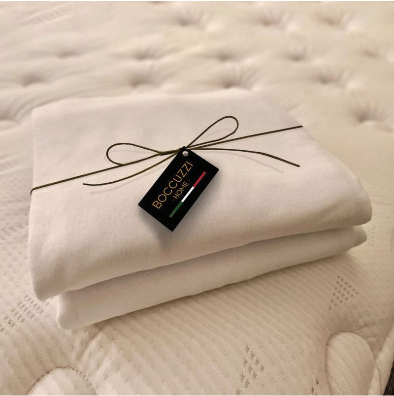
Bocuzzi Home B-1565